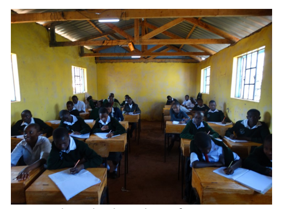
Students back to class after opening