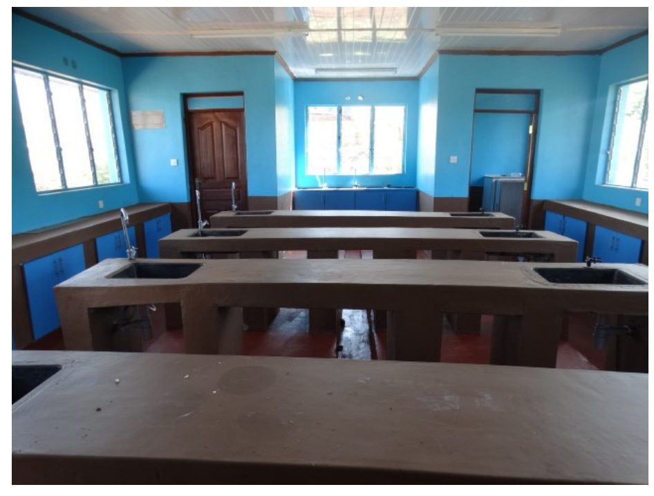
Current lab with a preparatory room and an office